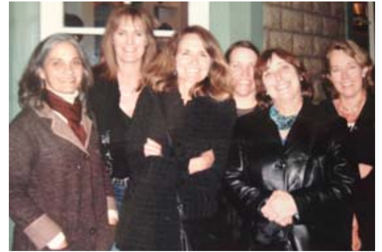
This mothers' group is still having fun.